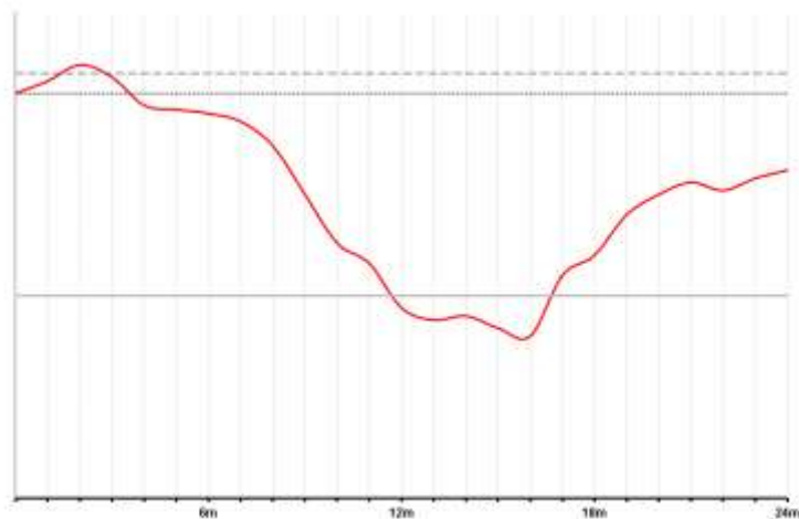
Time From Issue Date (in Months) and Valuation Dates

Example #2 – The Notes are not automatically called as the Closing Index Level on each Autocall Valuation Date is less than the Autocall Level. The Final Index Level on the Final Valuation Date is less than the Autocall Level, but greater than the Barrier Level.